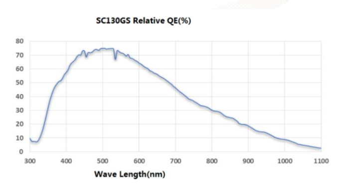
MV-CE013-80UM Quantum Efficiency